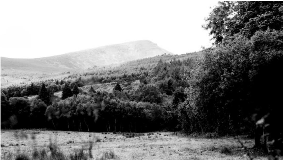
Fiona O'Dwyer, Down the Mountain series, b/w photograph,