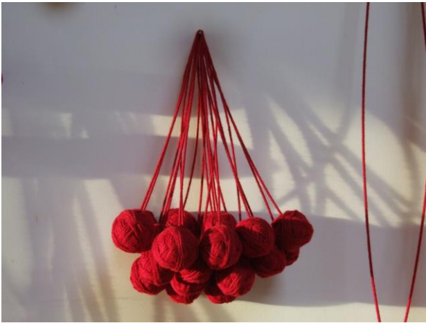
Repair , 2017, (detail of installation), salvaged piano strings, & Red thread